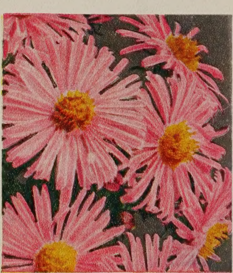
ASTER, Harrington's Pink

• Plant hardy perennials if you want bloom year after year with little care.